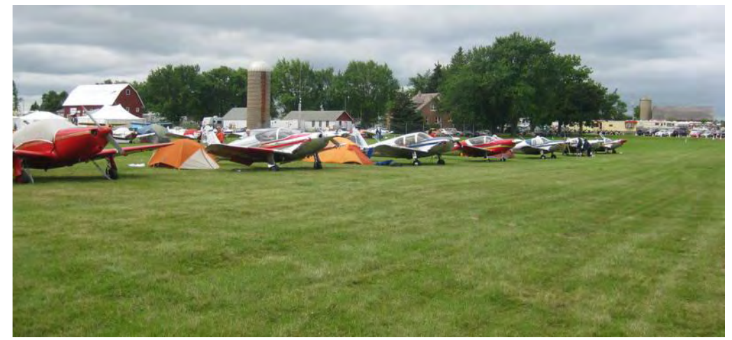
Early light line. We later filled the front row and had a good start on the second row.

I missed several Swifts that I did not get pictures of but here is a list of the ones I captured.