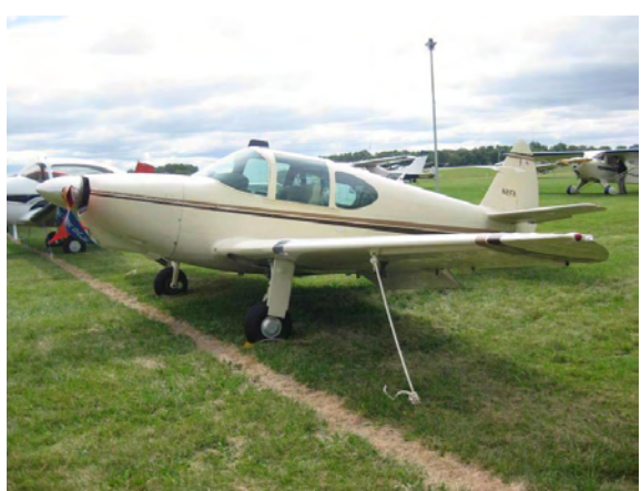
Mission Aviation Fellowship Swift