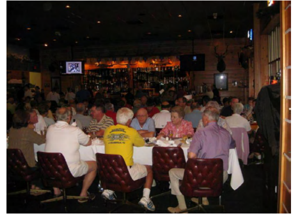
Barb made reservations for 35 and we had to add a table for extras. Great group and good food.