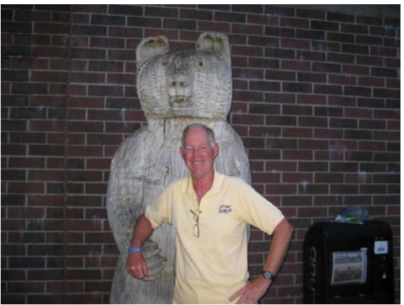
"Opie" with the "Grizzly One". No fear