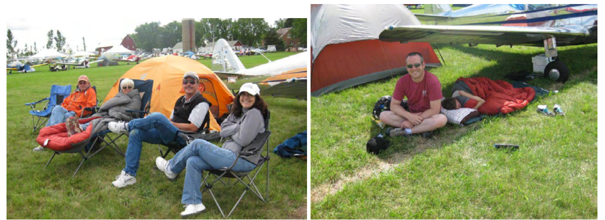
Keeping warm was a bit of a problem for the first couple of days

I missed several Swifts that I did not get pictures of but here is a list of the ones I captured.