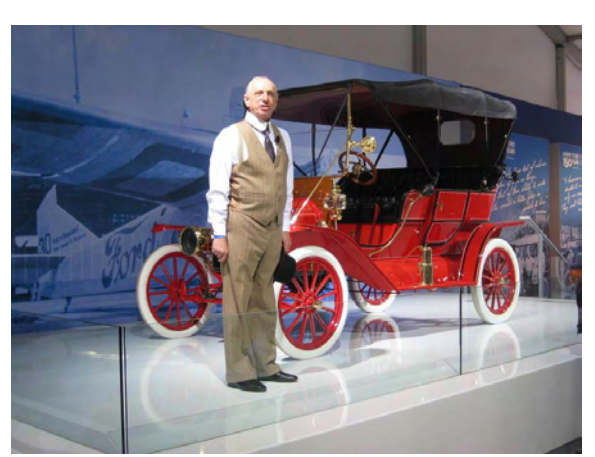
Henry Ford – Looking good

The fellowship on the flight line is always special. Mark Holiday stopped by and is looking great.