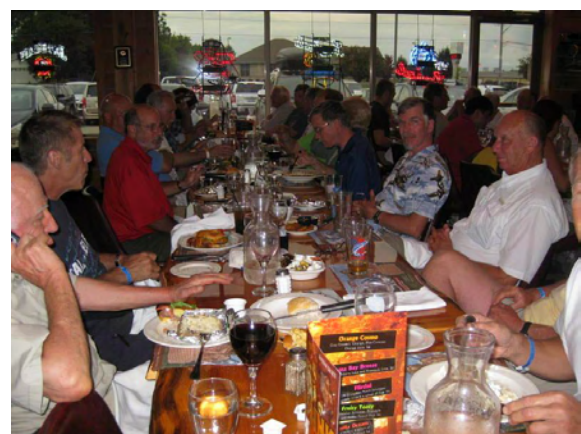
Swifters enjoying a wonderful meal