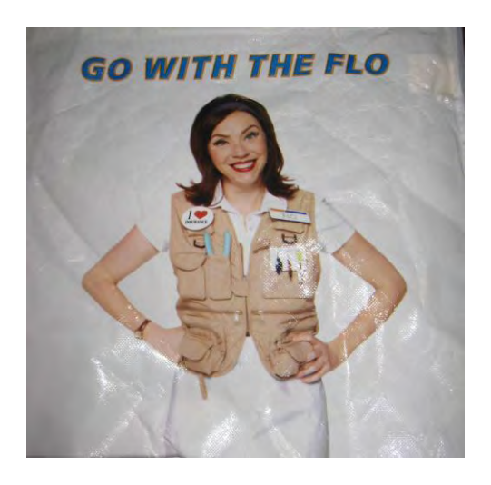
P.S. Flo says "See you next year Swifters"