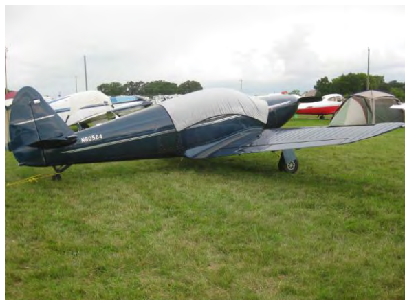
Deveaux Romain (Swift headed to France)