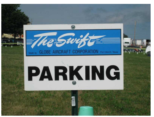
Swift Parking - Great place

I stopped by "Ole Yeller" one day and noticed how proud she stands.