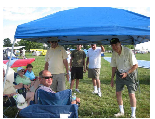
Breakfast at the Ultralight Barn