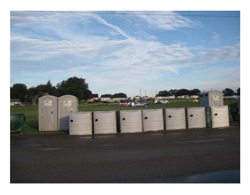
Level 7 wind – (Seven out of ten port-a-pots taken down by the storm-Note our Swifts in the background)

Friday evening was miserably hot and humid and Saturday evening treated us to a strong storm with level seven winds.