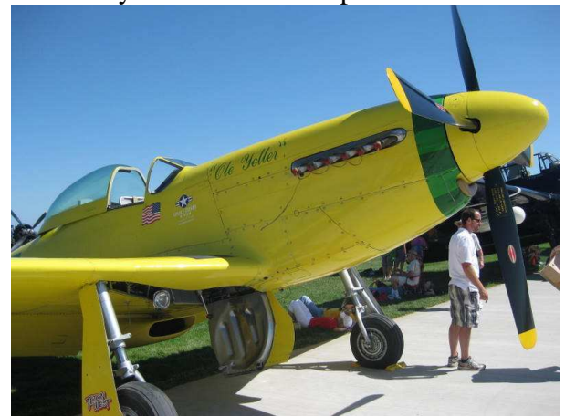
"If I couldn't be a P-51 I'd rather be a Swift" -- "Ole Yeller" quote I believe I heard.

I stopped by "Ole Yeller" one day and noticed how proud she stands.