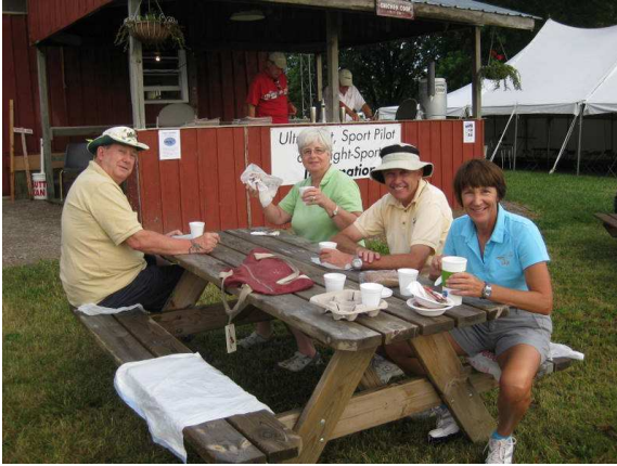
Breakfast at the Ultralight Barn

Oshkosh is about a lot of things and airplanes, although huge, are only a part of it. The fellowship with other aviators, Swifters, and future Swifters keep the week most enjoyable.