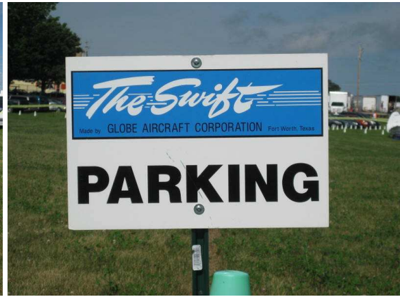
Swift Parking - Great place

I stopped by "Ole Yeller" one day and noticed how proud she stands.